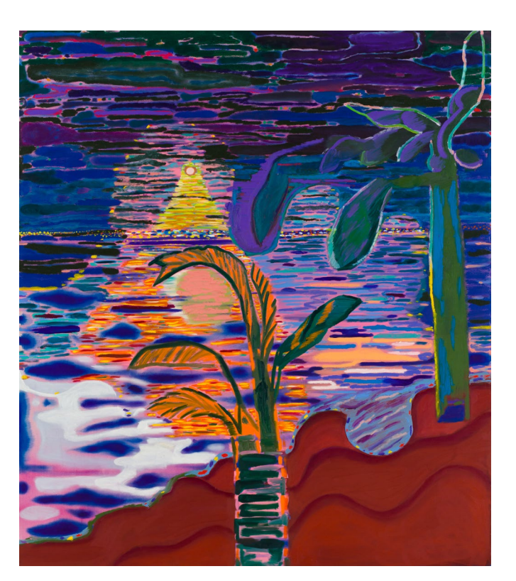
Shara Hughes, The Not Dark Dark Spots , 2017, oil and dye on canvas, 68 x 60 inches, Private Collection © Shara Hughes

This exhibition benefits from the generous loans of several institutions including SFMOMA, The Whitney Museum of American Art, The Frederick R. Weisman Art Museum, The Heckscher Museum as well as major private collections such as the Myron Kunin Collection.